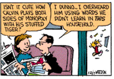
Cartoon strip from: Best Calvin and Hobbes Collection, http://chquotes.synthasite.com/search.php