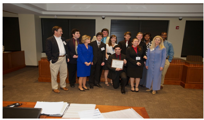
State Champions with Judges.

"Investing in our future, creating tomorrow's leaders" GRAY STONE DAY TAKES STATE CHAMPIONSHIP